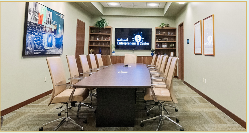
Executive Conference Room