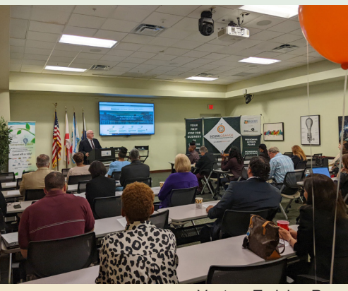
Venture Training Room

Video conferencing is available at an additional fee.